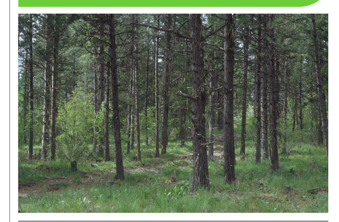
USDA's Natural Resources Conservation Service offers voluntary Farm Bill programs that benefit agricultural producers and the environment.